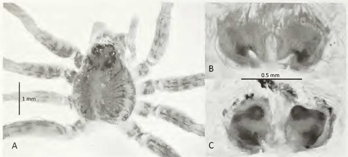
Fig. 2: Pardosa aenigmatica Tongiorgi, 1966: A. Habitus of female; B. Epigyne, ventral view; C. Vulva, dorsal view